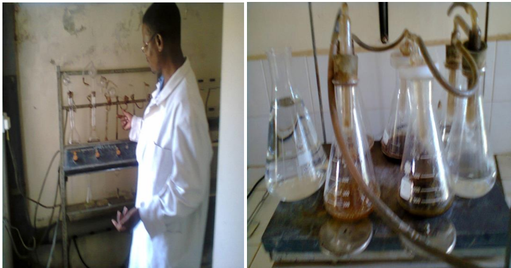
a) Determination of CP by the Kjeldahl apparatus