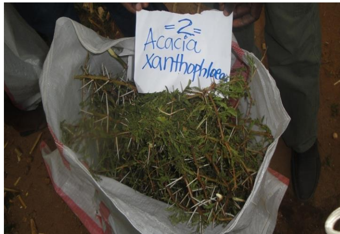
Plate1: Acacia xanthophloea sample collected from Kibaya, Kiteto

Acid detergent lignin (ADL) was determined by using techniques described by Van Soest et al. (1991). Percentage of ADL content was determined by stirring ADF residues in porous crucible with sulfuric acid ( H_2SO_4 ) for 4 h. The sample was dried in forced air oven at 105^\circ C , then ignited in the muffle furnace at 550^\circ C for 24 h and weight of the ash was recorded.