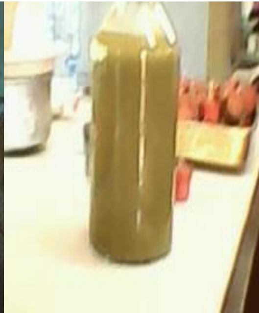
b) Filtered rumen liquor ready for use