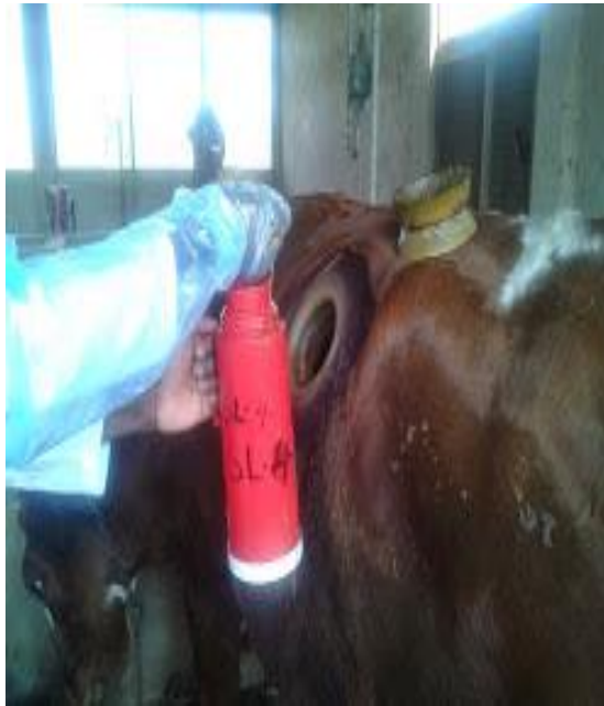
a) Collecting rumen liquor from a fistulated cow