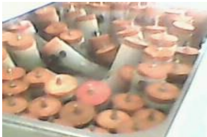
Plate 4: Samples mixed with rumen liquor and artificial saliva being incubated